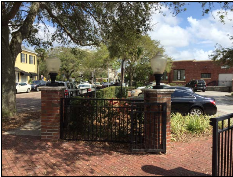
Winter Park Farmer's Market view from corner of New York Avenue, and New England Avenue. Proposal location is North West (form this view) across railroad tracks.