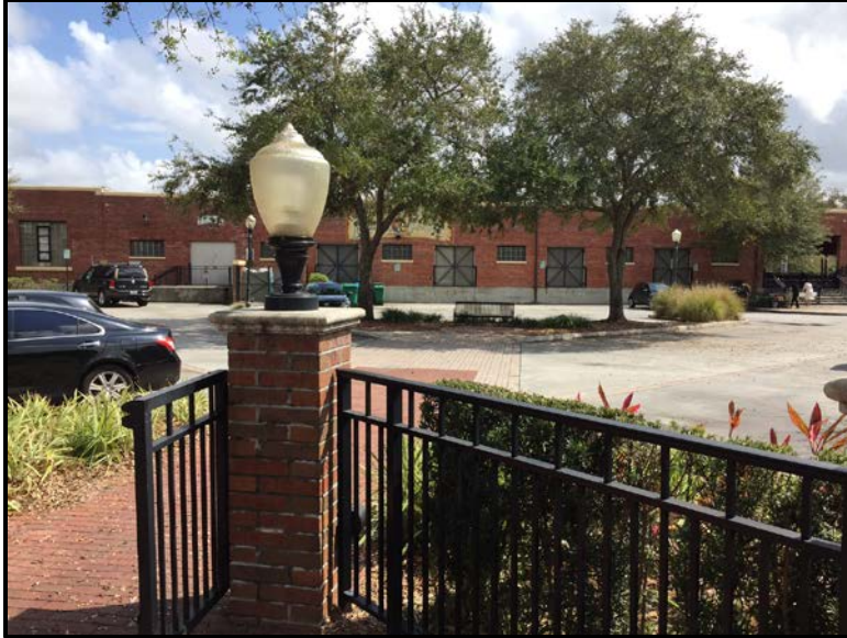
Winter Park Farmer's Market, view from New York Avenue in Winter Park