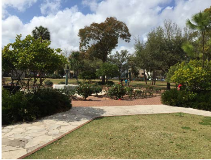
Just for perspective purposes, you can see the fountain here with Park Avenue to your back. The proposal site is to the left.