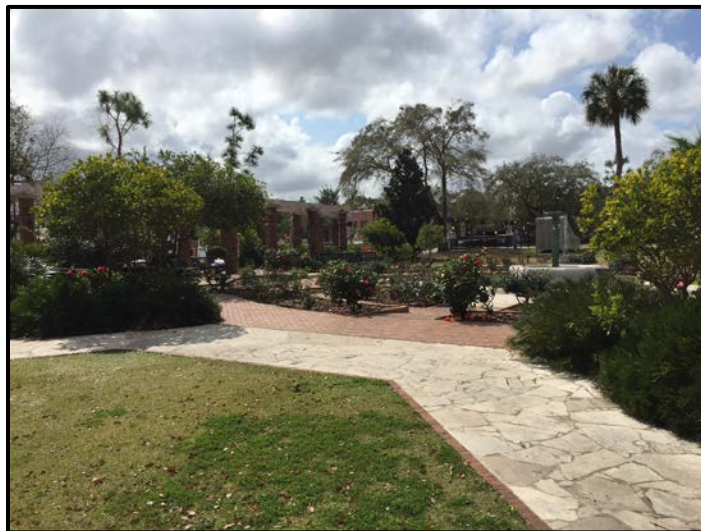
In this photo, you can see the proposal site clearer, and the fountain.